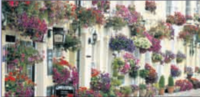
Hanging baskets in full flower adorn Beach Street in Deal

With this in mind, Deal and Walmer Chamber of Trade is focusing on potential